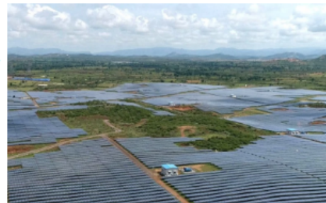
Solar power plant.

The renewables developer said on Tuesday it had received a Letter of Award (LoA) from Maharashtra State Electricity Distribution Company Limited (MSEDCL) to move forward with the project. It said it had been awarded the project through competitive bidding, followed by a reverse e-auction.